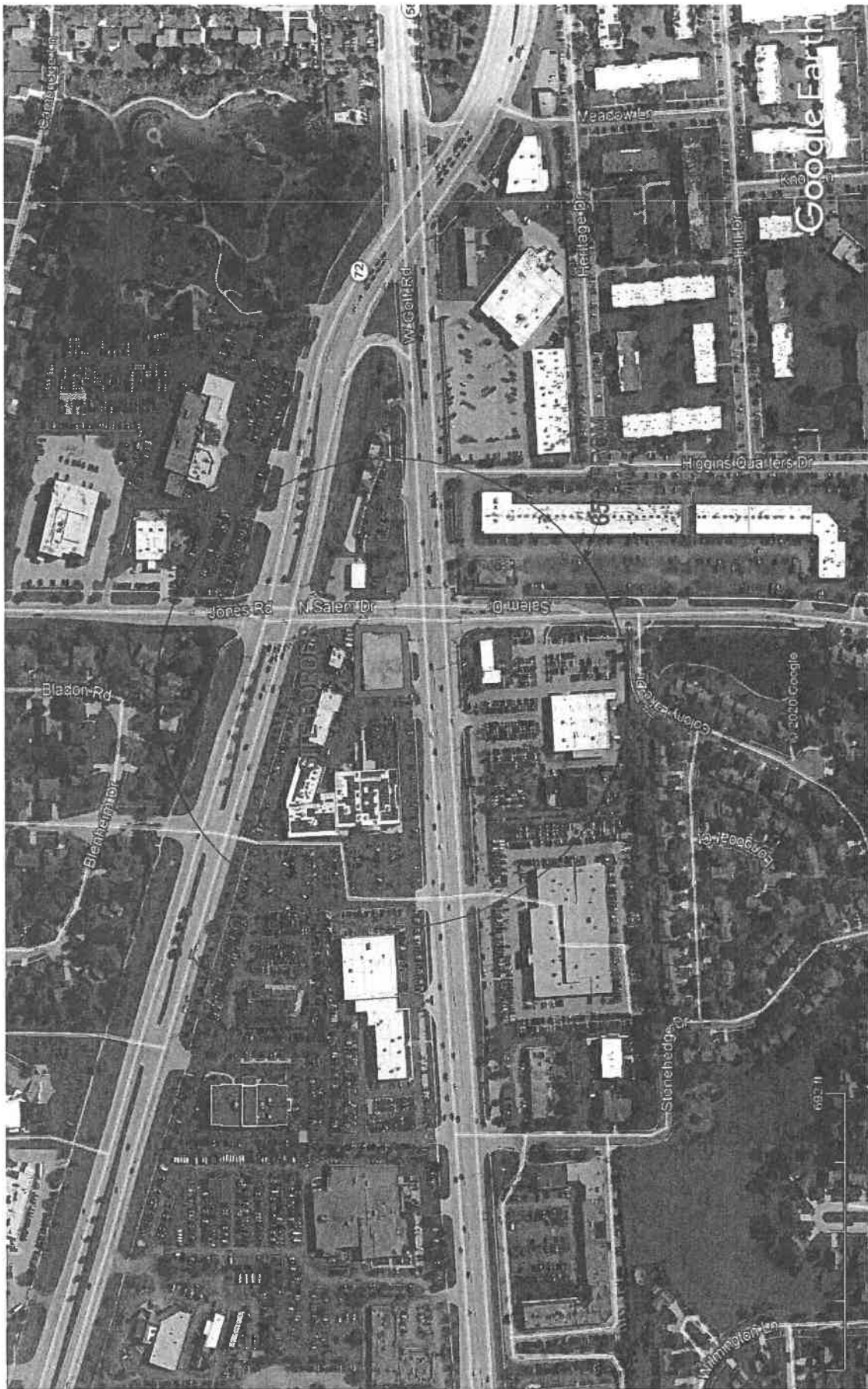
FIGURE 8 - MODELED EXTENT OF GROUNDWATER CONTAMINATION