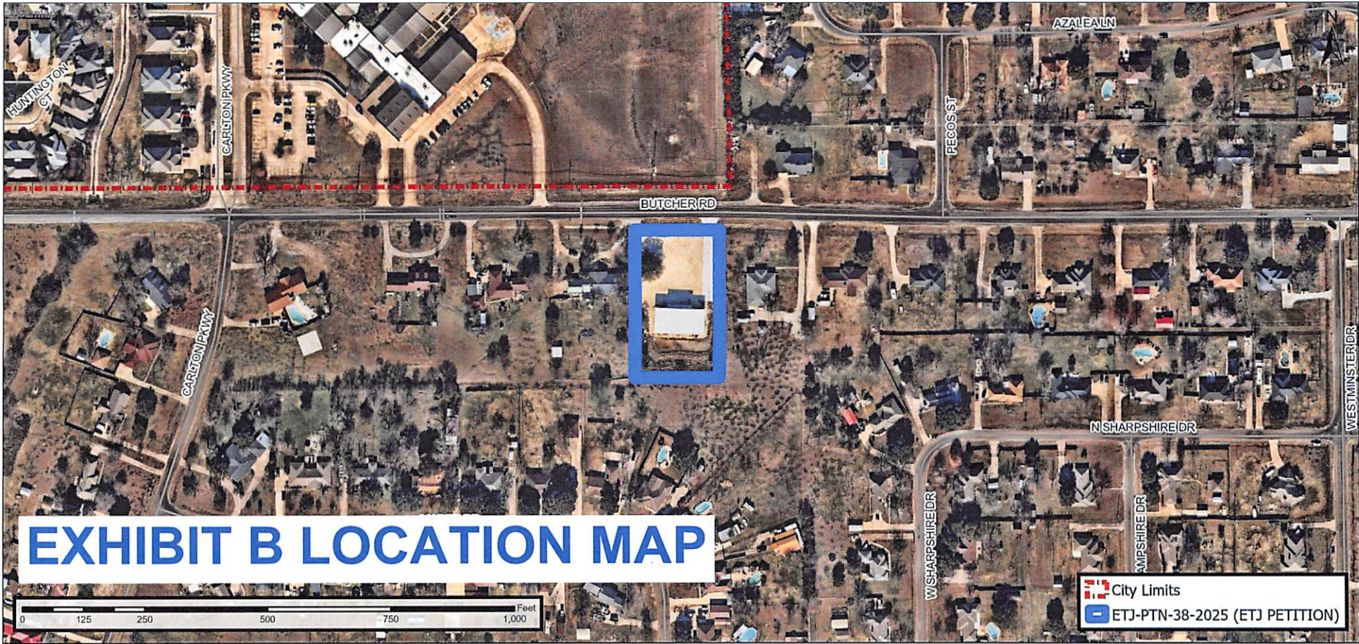
EXHIBIT B LOCATION MAP