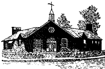
TOWN BUILDING HARRISVILLE, R.I.